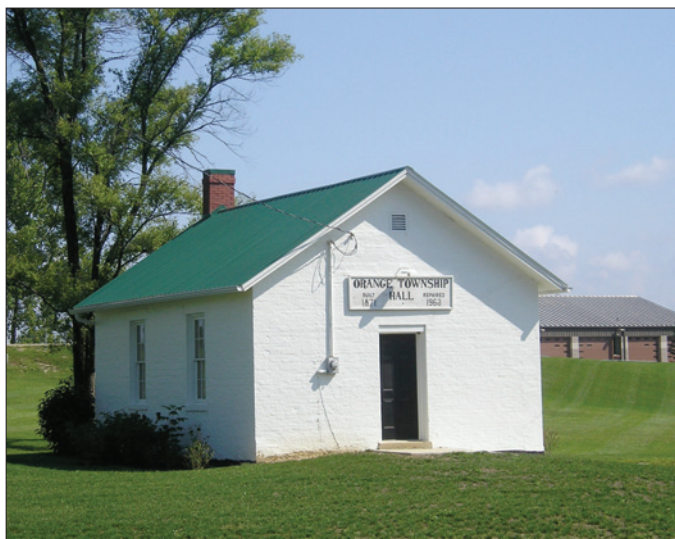
The original Orange Township Hall—35 employees reported each month

Interestingly, there are more small employers (2,600) but they process fewer employees (52,000). The large employers are fewer in number (600), but they process the bulk of employees (298,000).