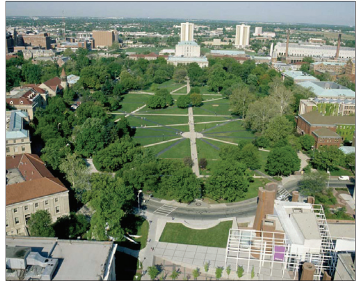
The Ohio State University—20,000 employees reported each month